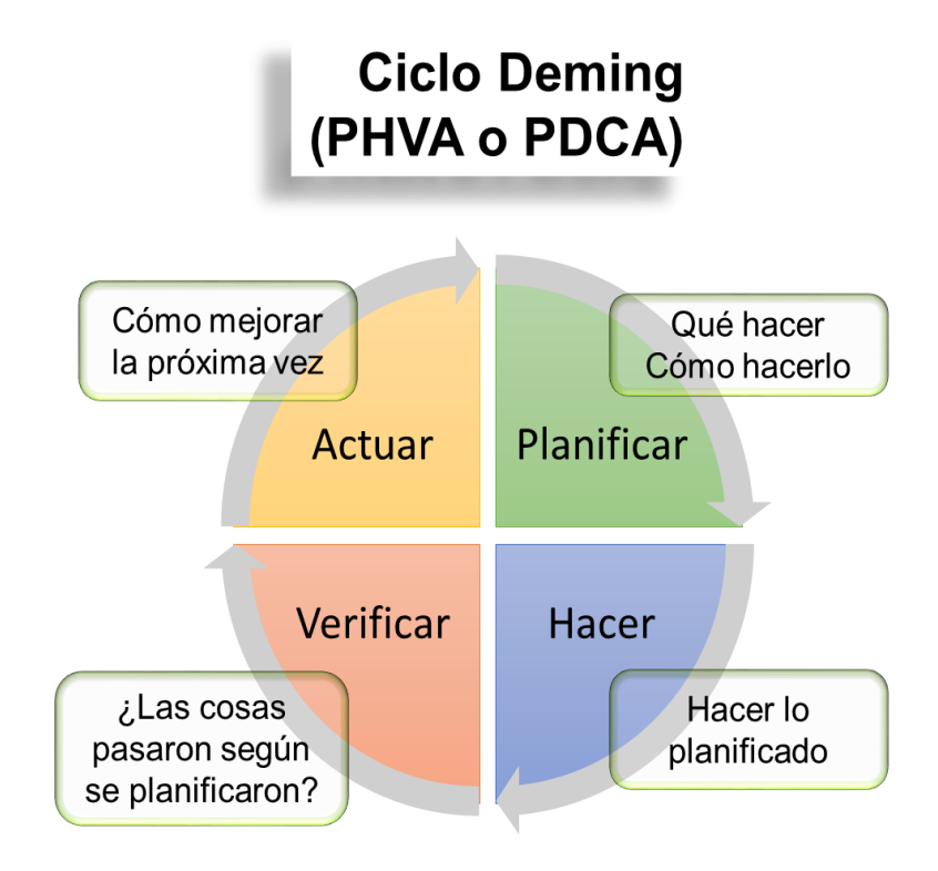
Figure 1. Deming cycle.

The following figure is a summary of it, where each activity is framed in an endless cycle.